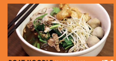
BOAT NOODLE (DRY/SOUP (PORK OR BEEF) 💮 😽 Rice noodle in Thai specialty broth