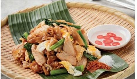
PAD SEE EW Stir fried flat rice noodle with egg, chinese broccoli and sweet soy sauce