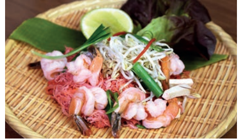
PAD MEE SEE CHOMPOO (PINK NOODLE) PAD MEE KORAT 6 1 Stir fried thin rice noodle with pink soy bean paste