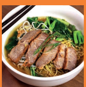
BBQ PORK ® WITH EGG NOODLE