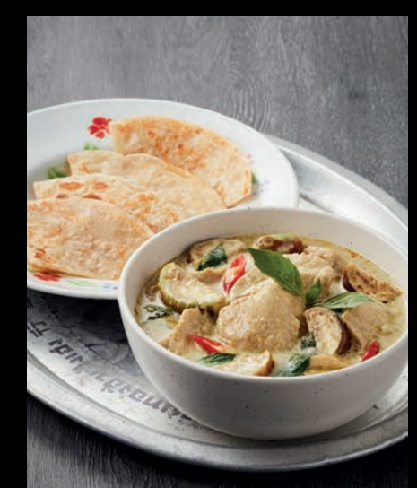
GREEN CURRY WITH RICE OR ROTI Choice of meat with asian eggplant and vegetable

- 10% SERVICE CHARGE ON PUBLIC HOLIDAY'S