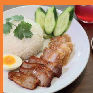
17.9 CRISPY PORK BELLY 20.9 BBQ PORK AND (3) 20.9 CRISPY PORK BELLY