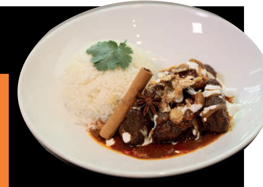
BEEF MASSAMAN CURRY WITH RICE OR ROTI Potato and peanut