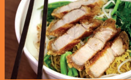
CRISPY PORK 6 WITH EGG NOODLE (DRY/SOUP)