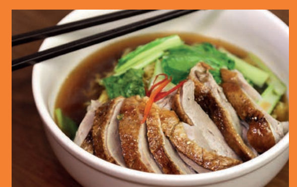
DUCK NOODLE SOUP