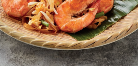
Stir fried Thin rice noodle with egg, tamarind sauce, tofu, ground peanut, bean sprout and garlic chive