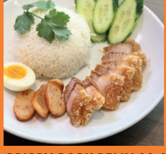
WITH RICE ®