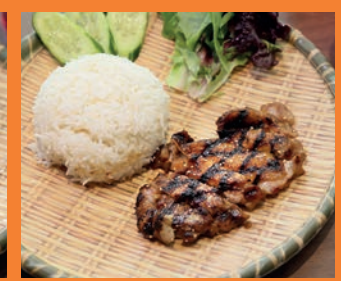
WITH RICE Serve with north-easthern style sauce