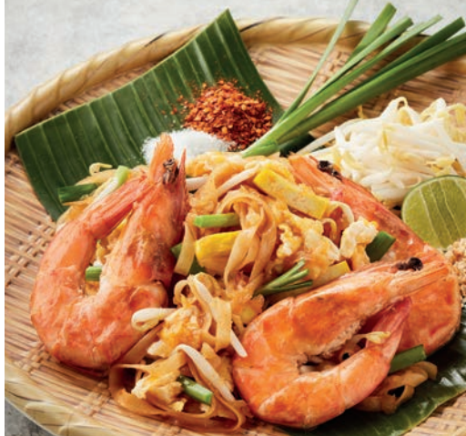
Stir fried flat rice noodle with fresh chilli, basil, peppercorn, onion and fingerroot