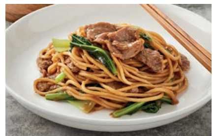
PAD MEE PHUKET Stir fried Hokkien Noodle with egg, red onion, chinese broccoli, and garlic chive