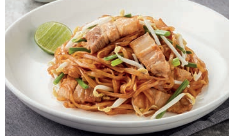
18.9 Stir fried thin rice noodle with pork belly, red onion, fermented soybean, tamarind sauce and garlic chive