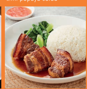
THAI-HAINANESE 17.9 STEWED PORK (6) 18.9 CHICKEN WITH RICE