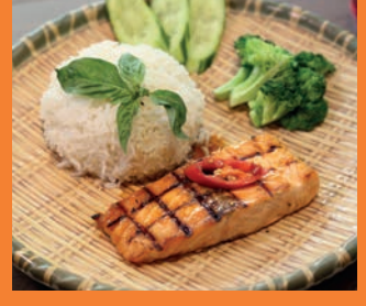
ROASTED DUCK 12.9 GRILLED SALMON 24.9 GRILLED CHICKEN 17.9 WITH RICE serve with Chilli Basil sauce